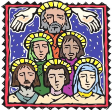
ALL SAINTS' DAY